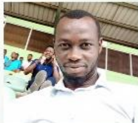
+234 814 675 1018 Secretary